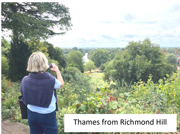
Thames from Richmond Hill